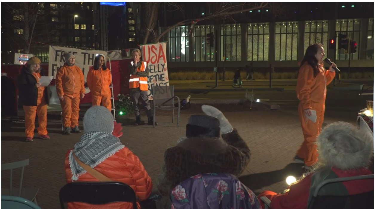
UK dissidents draw attention to US-Zionist crimes on inauguration day