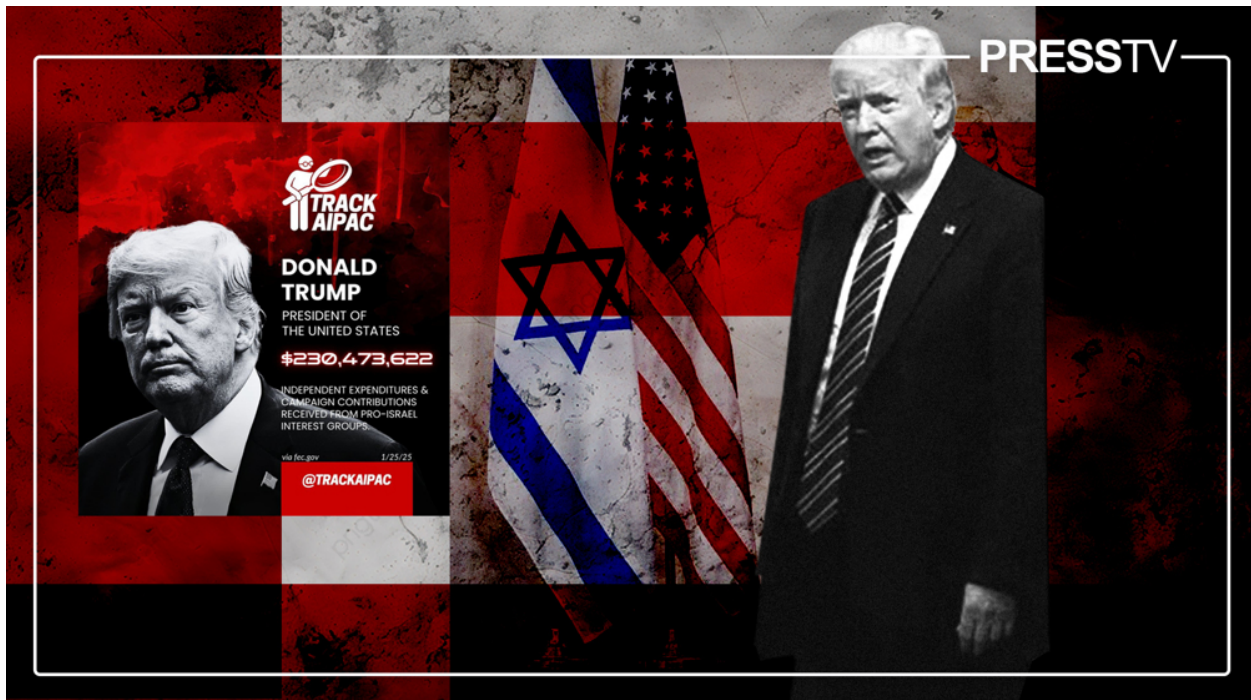
Trump's bellicose rhetoric to 'clean out' Gaza tied to deep pockets of Zionist lobby