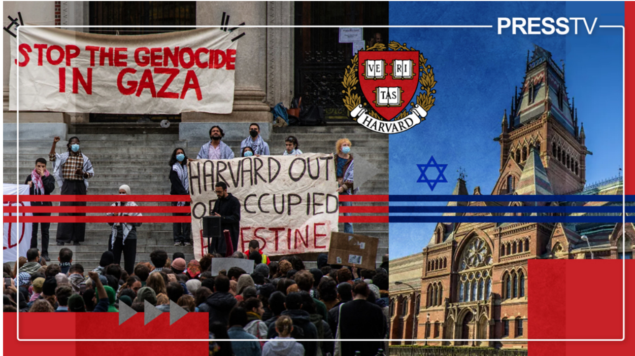
Harvard muzzles pro-Palestine voices by adopting Zionist lobby's antisemitism definition