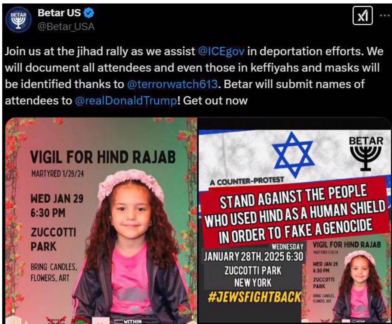
Screenshot of Betar US social media post on January 29

Founded in 1923 by Ze’ev Jabotinsky, a Zionist figure, and named after Brit Yosef Trumpeldor, Betar US actively spreads Zionist propaganda and in recent months, the group has intensified efforts to identify foreign students in the US who participate in anti-Israel protests, seeking their deportation.