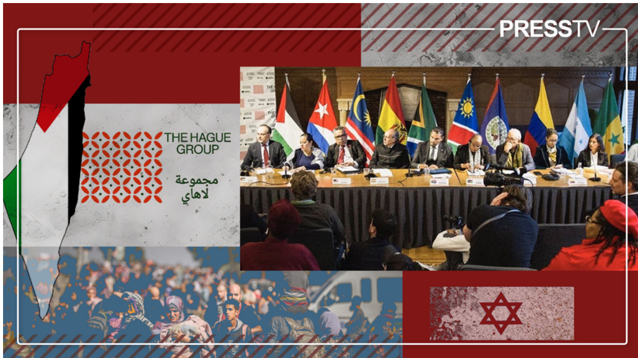
Formation of 'The Hague Group' a fresh challenge to Zionist impunity