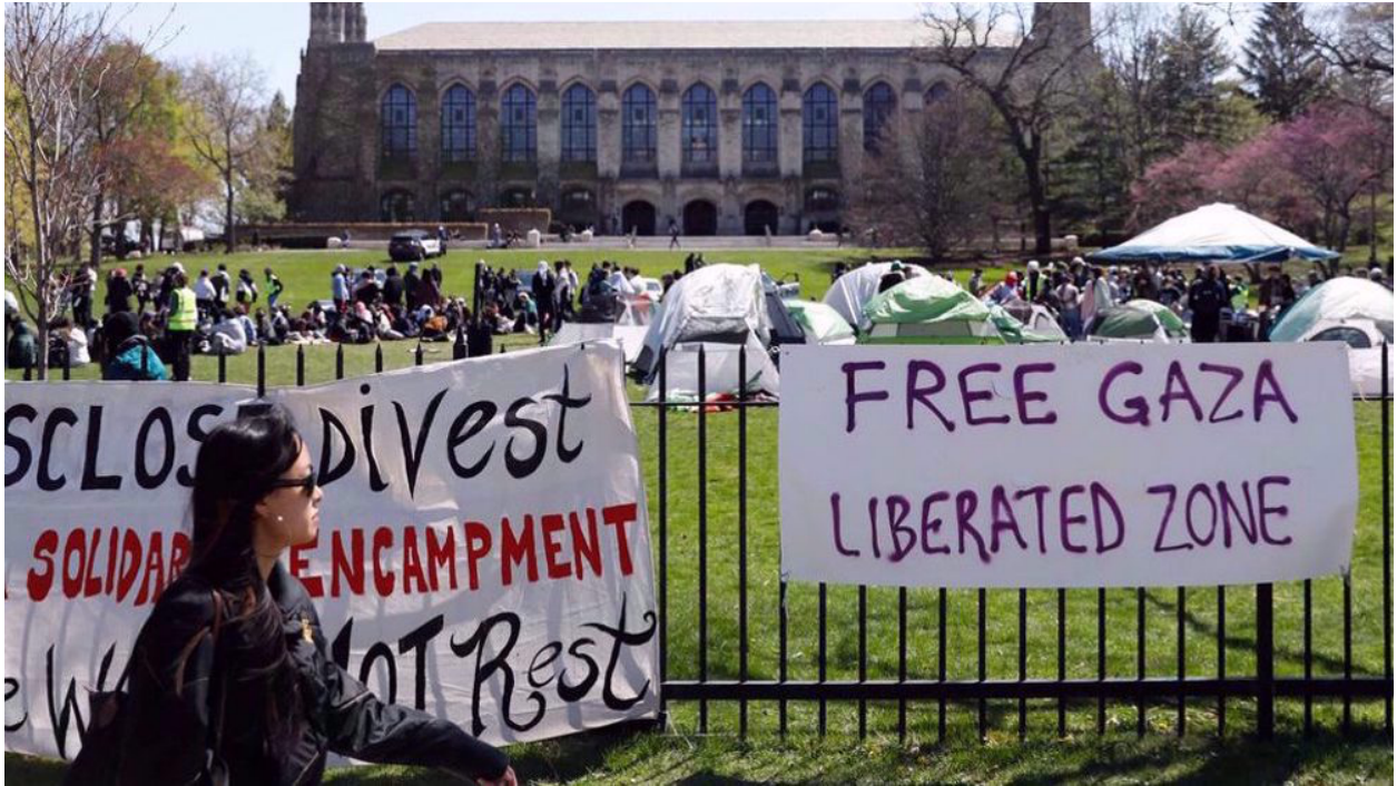
'Zionist group sending Trump list of pro-Palestine students for deportation'