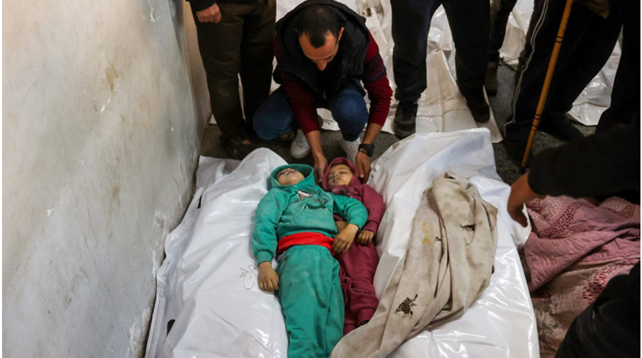
Gaza genocide: Death toll rises to nearly 62,000 as thousands of missing declared dead