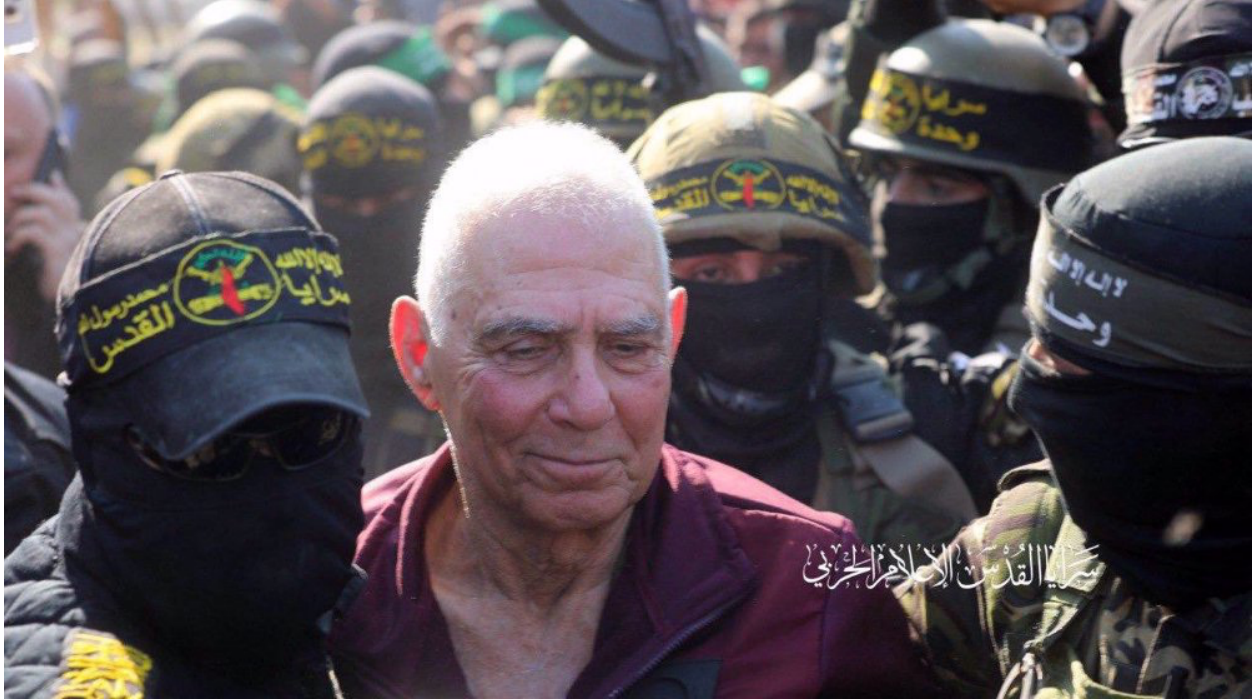
Praise for Hamas earns 80-year-old freed Israeli captive wrath and abuse of settlers